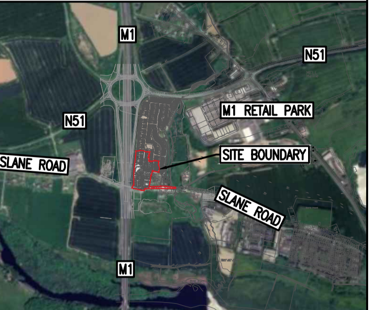
GOOGLE MAP LOCATION MAP SCALE 1:20000